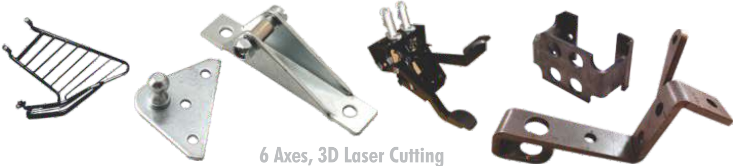
6 Axes, 3D Laser Cutting